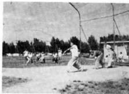
Shown above are members of the MTPRA Intramural Softball League starting off the 1958 season at the Melbourne airport softball diamond. Eight teams are entered in the League with games scheduled through July. After end-of-season play-offs, trophies will be presented to the winning team and to an all-star selection chosen by the players.