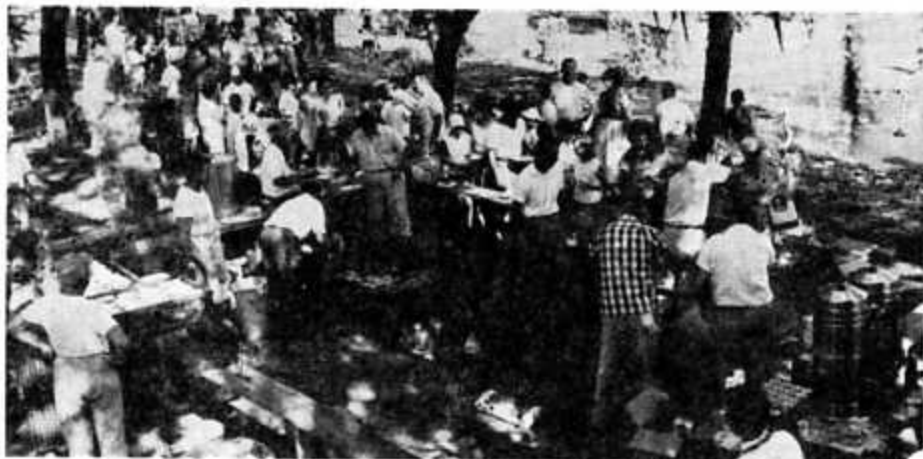
MTPRA members and their families are shown as they stand in line at the fish stand during the MTPRA Picnic, held on June 1 at Eau Gallie Waterfront Park. The picnic drew a crowd estimated at 1300. Among features of the gala event were a casting contest, a water ski exhibition, kiddie games, kiddie rides and all the fish, hush puppies, cole slaw, coffee and soft drinks the group could consume.