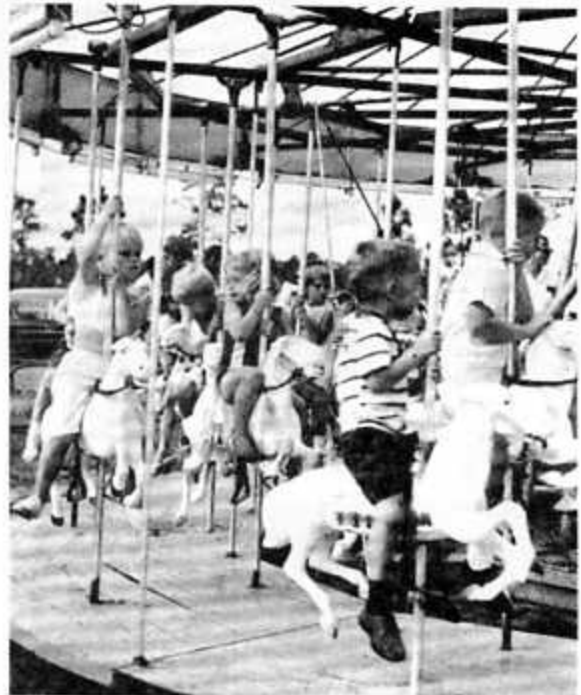
Rides and games, interrupted briefly but frequently for ice cream and soda pop, highlighted the day for several hundred children of MTP personnel at the Fun Festival September 25.