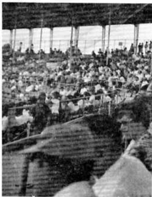
Astros took the short end 4-1