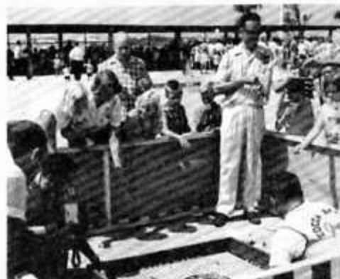
Coin toss was one of the games.