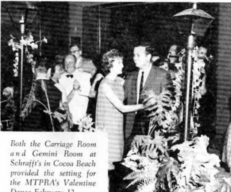
Both the Carriage Room and Gemini Room at Schrafft's in Cocoa Beach provided the setting for the MTPRA's Valentine Dance February 13.