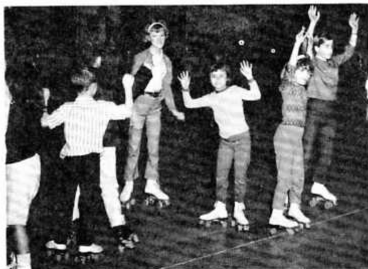
Doing the "hokey-pokey" was one of the features of an MTPRA skating Party at the Skateland