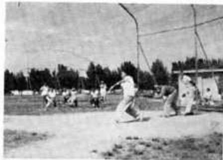
Shown above are members of the MTPRA In-tramural Softball League starting off the 1958 season at the Melbourne airport softball diamond. Eight teams are entered in the League with games scheduled through July. After end-of-season play-offs, trophies will be presented to the winning team and to an all-star selection chosen by the players.