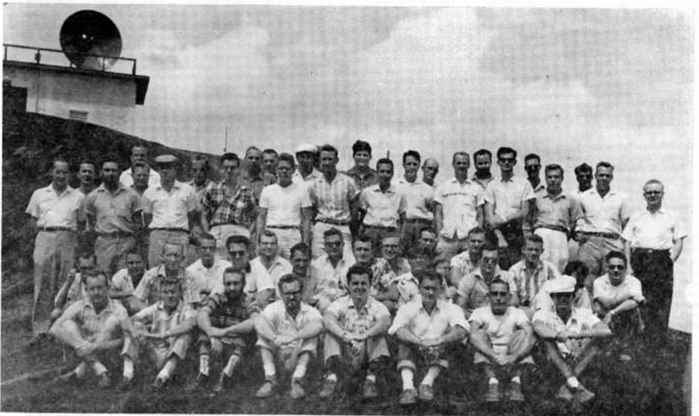
This photograph shows RCA Missile Test Project employees at Ascension Island, terminal station on the 5000 mile Atlantic Missile Range.