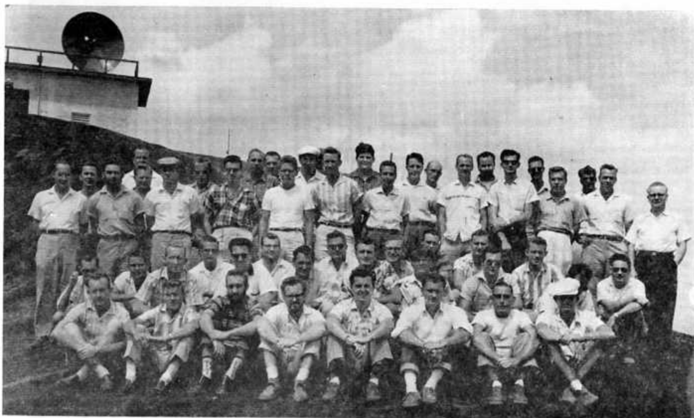
This photograph shows RCA Missile Test Project employees at Ascension Island, terminal station on the 5000 mile Atlantic Missile Range.